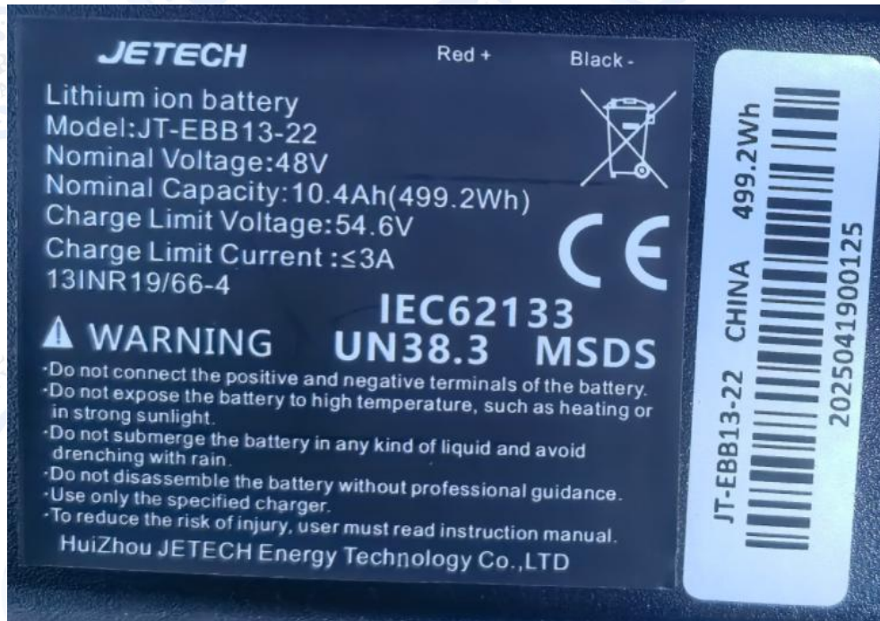
Photo 5 铭牌 Label