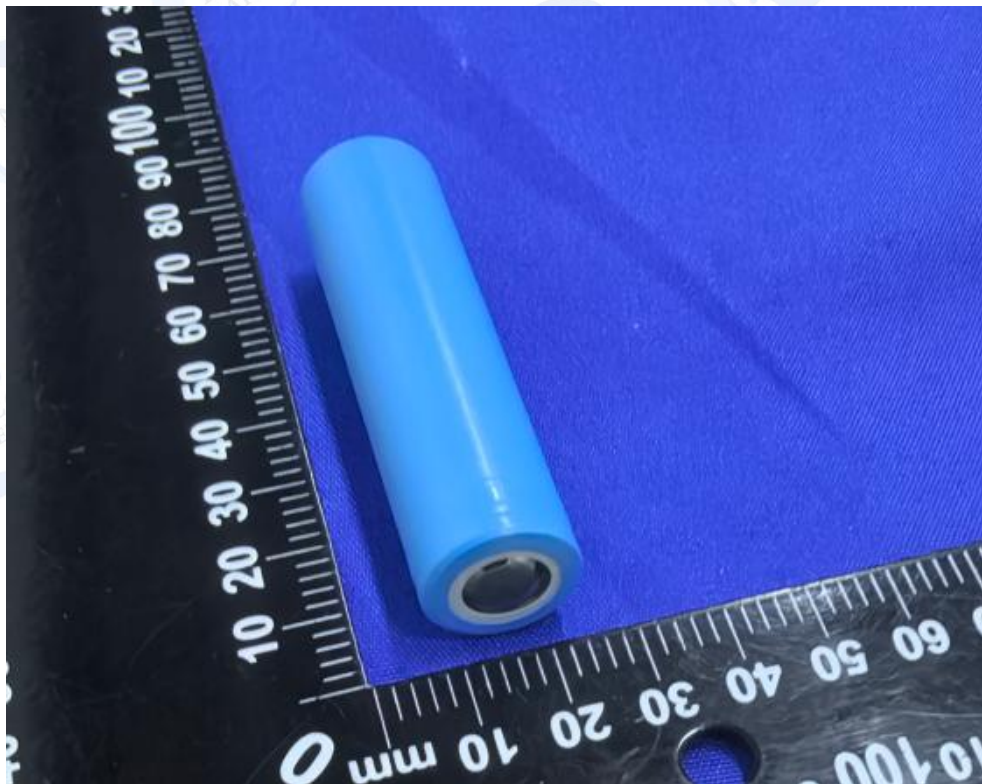
Photo 4 内部电芯 Internal Cell