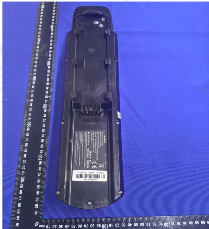
Photo 2 反面 Rear