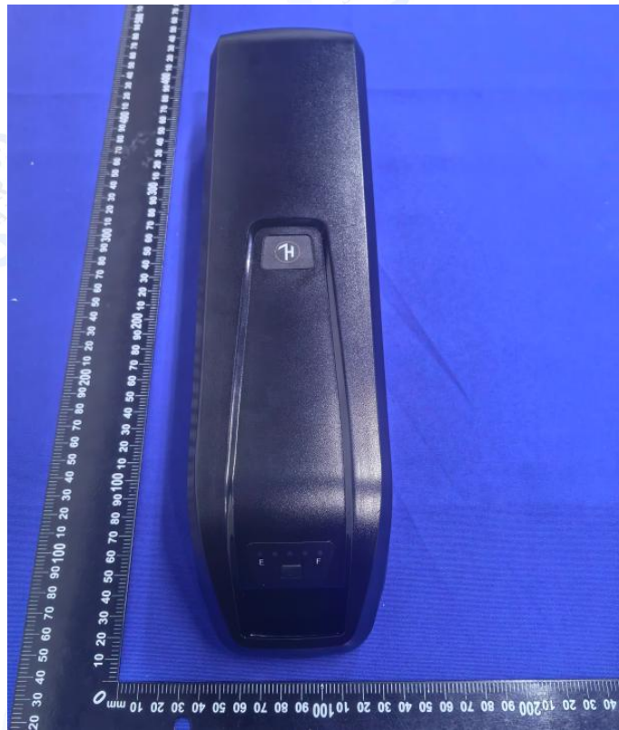
Photo 1 正面 Front