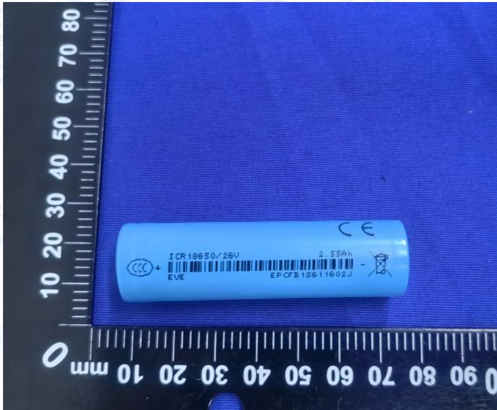
Photo 3 内部电芯 Internal Cell