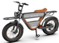
K1 With Front And Rear Rack