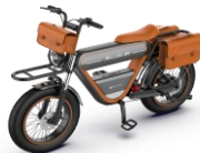
K1 With Bags